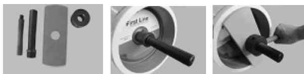
FIRST LINE head removal tools

FIRST LINE Head Removal Tools - A set of head removal tools is available from FIRST LINE. These head removal tools are expressly designed for the purpose and have proven to be an effective and easy way to remove the vessel head without causing any damage to the vessel.