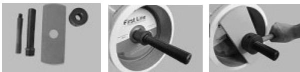
FIRST LINE head removal tools

FIRST LINE Head Removal Tools - A set of head removal tools is available from FIRST LINE. These head removal tools are expressly designed for the purpose and have proven to be an effective and easy way to remove the vessel head without causing any damage to the vessel.